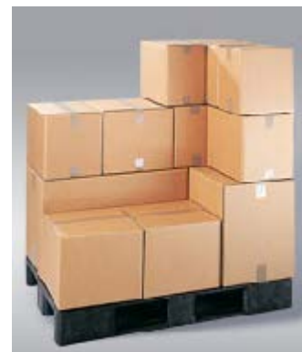
Stackable vs. Non Stackable