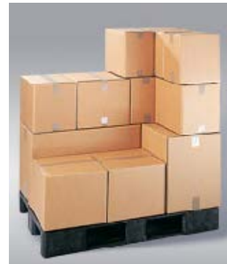
Stackable vs. Non Stackable